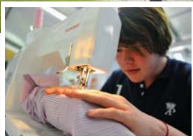
Sixth Form Academy