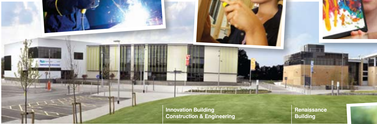
Innovation Building Construction & Engineering