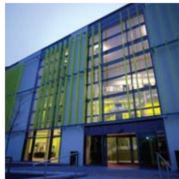
The new Jubilee Building, part of Selby College's brand new campus.

Please Note: If your employer is paying for the course, we will require a signed letter of confirmation from your employer at the time of enrolment.